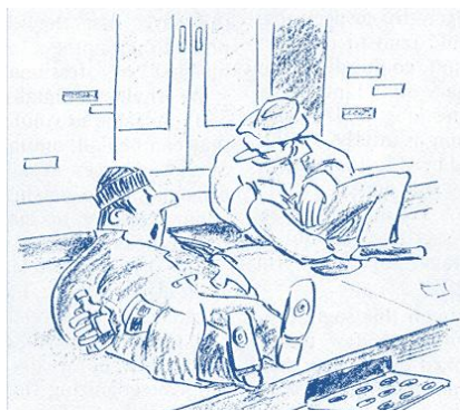
| can't join — | ain't hit bottom yet

Word around the office is that you have a Bad Attitude