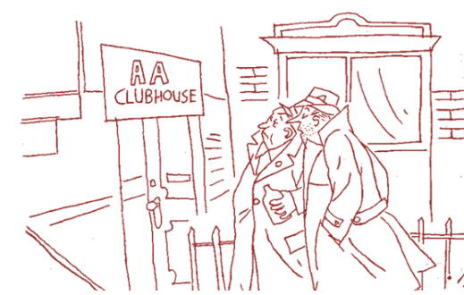
"Fr'end o'mine Went in there once an' nobodu's seen him since!"